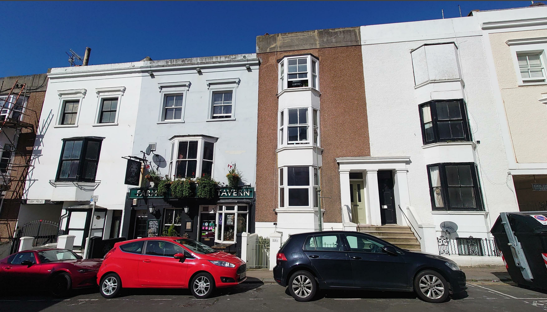
MAISONETTE, 14 FARM ROAD, HOVE, BN3 1FB