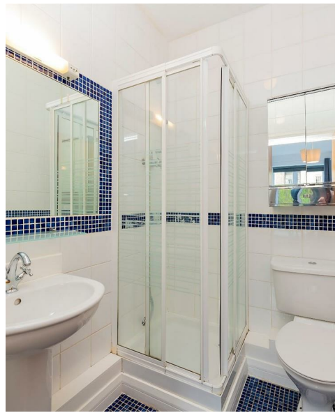
ENSUITE W.C., wash hand basin and shower.