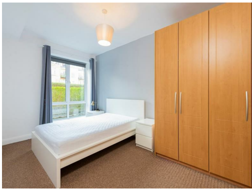
BEDROOM 1 2.62m x 4.46m Double bedroom with built in wardrobes.