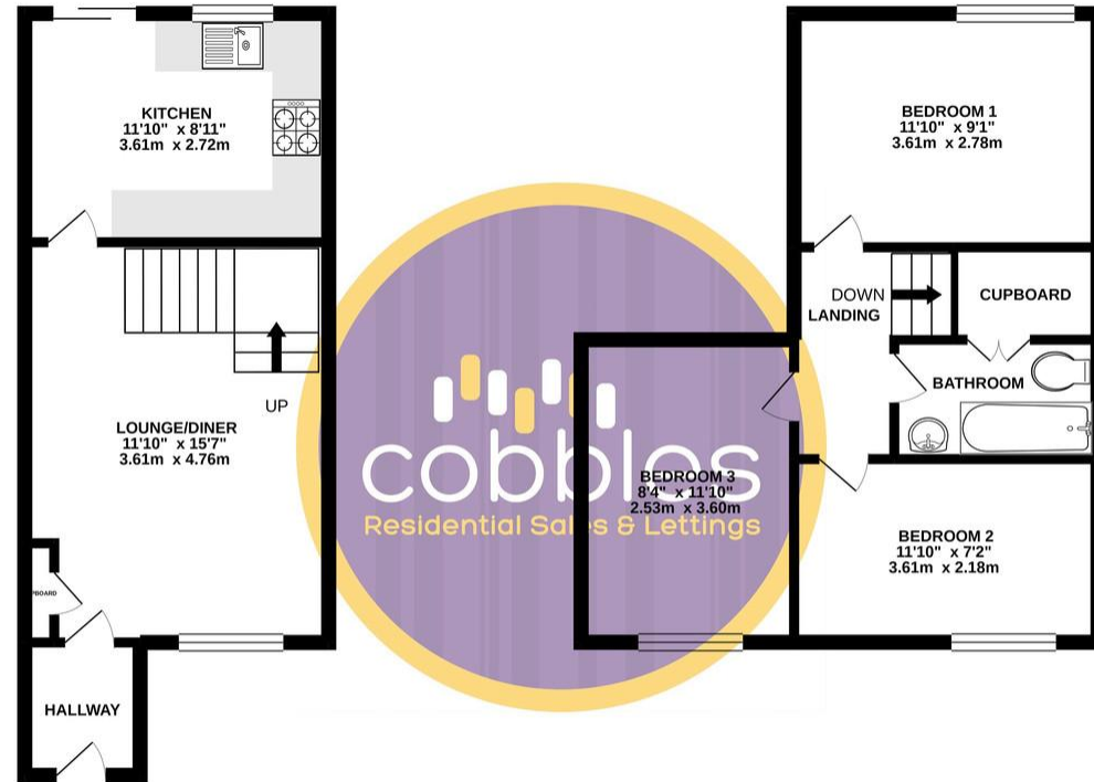
1ST FLOOR 389 sq.ft. (36.1 sq.m.) approx.

TOTAL FLOOR AREA: 703 sq.ft. (65.3 sq.m.) approx. Whilst every attempt has been made to ensure the accuracy of the floorplan contained here, measurements of doors, windows, rooms and any other items are approximate and no responsibility is taken for any error, omission or mis-statement. This plan is for illustrative purposes only and should be used as such by any.