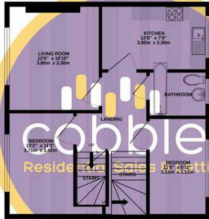
1ST FLOOR 570 sq.ft. (52.9 sq.m.) approx.