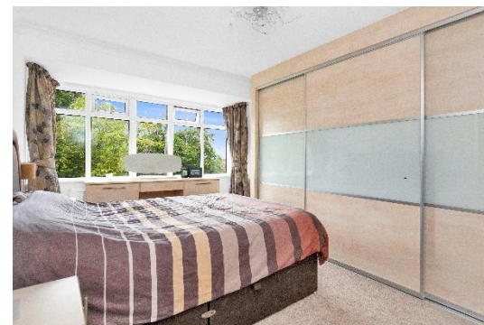
Redstone Hill Approx. Gross Internal Floor Area 1691 sq. ft / 157.13 sq. m