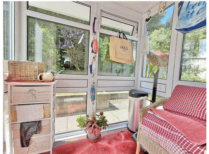
DINING ROOM 10'6" x 8'11" (3.21m x 2.72m)

Upvc double glazed window with access door to rear garden.