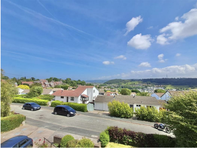
VIEW FROM LANDING