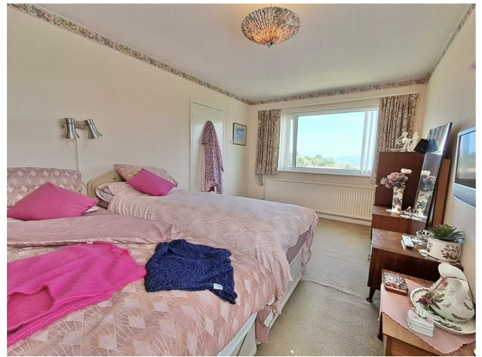
VIEW FROM BEDROOM 1