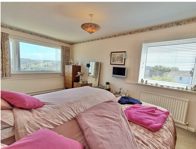
DUAL ASPECT BEDROOM 1 15'5" x 10'0" (4.71m x 3.06m )