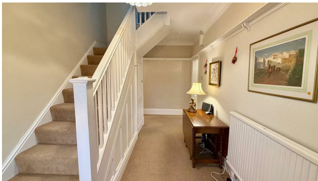
Plate rack, under stairs cloaks cupboard with light.