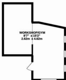
OUTBUILDING 283 sq.ft. (26.3 sq.m.) approx.