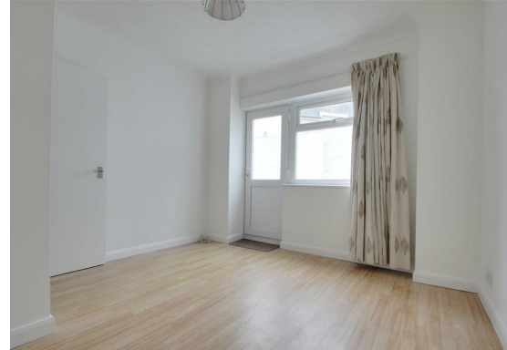
Bedroom Two 8'4 x 7'10 (2.54m x 2.39m) Bathroom West Facing Courtyard Garden