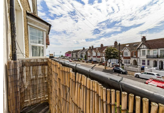
Balcony with sea views