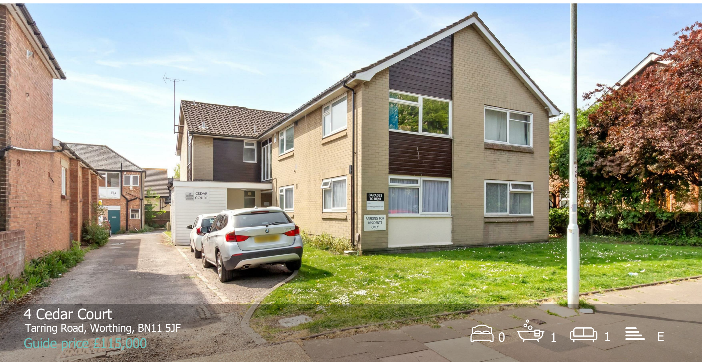
4 Cedar Court Tarring Road, Worthing, BN11 5JF Guide price £115,000