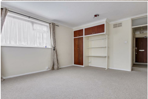
Studio Room 15'5 x 12'1 (4.70m x 3.68m)