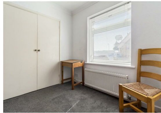
Bedroom Two With Fitted Wardrobes 11'3 x 9'5 (3.43m x 2.87m)