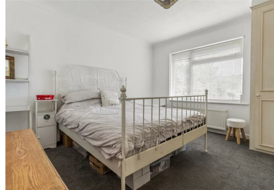
Bedroom One With Fitted Wardrobes 11'11 x 11'6 (3.63m x 3.51m)