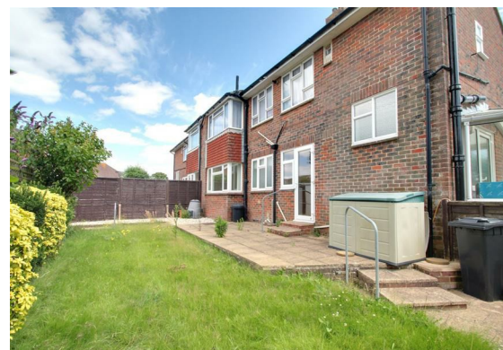
Garden Shed 7'10 x 3'10 (2.39m x 1.17m)