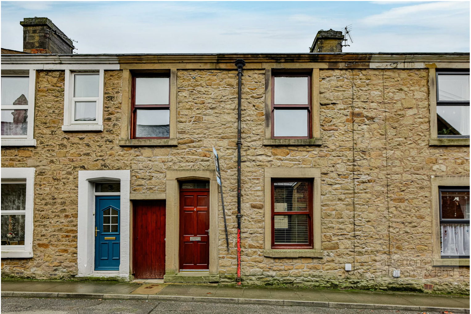
4 Chapel Street, Longridge Preston